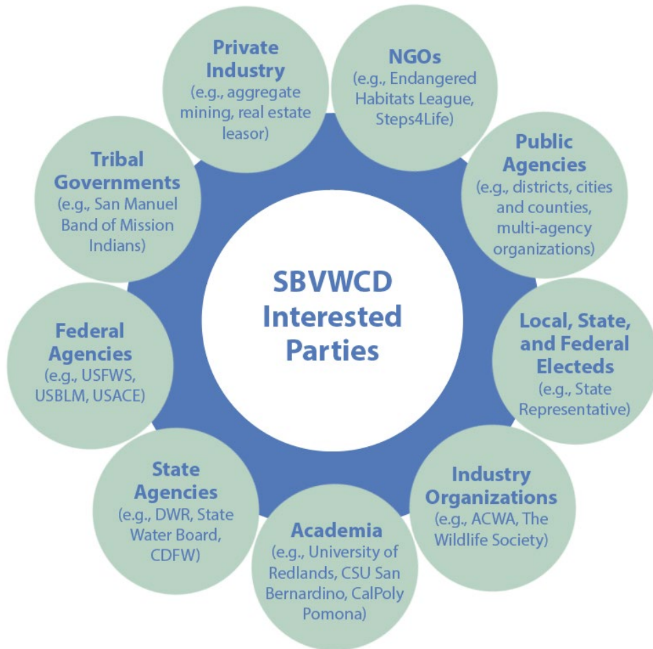
Figure 1. Partnership Categories

Generally, the Conservation District’s interested parties fall into at least one of the categories shown on Figure 1 . Detailed descriptions of each of the Interested Parties listed in Section 3 and more are provided as Appendix A: Interested Party Profiles .